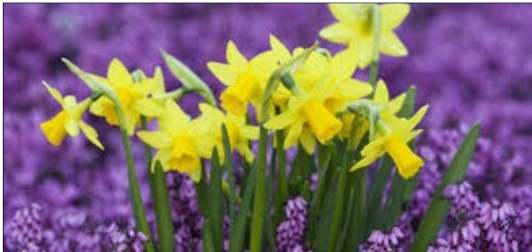
Welcome Spring, HA,HA!