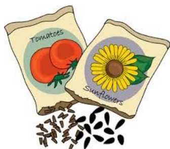
The Old Farmer's Almanac

Also, check to find out whether the seeds need special treatment, such as presoaking, scarification (nicking the seed coat), or stratification (chilling).